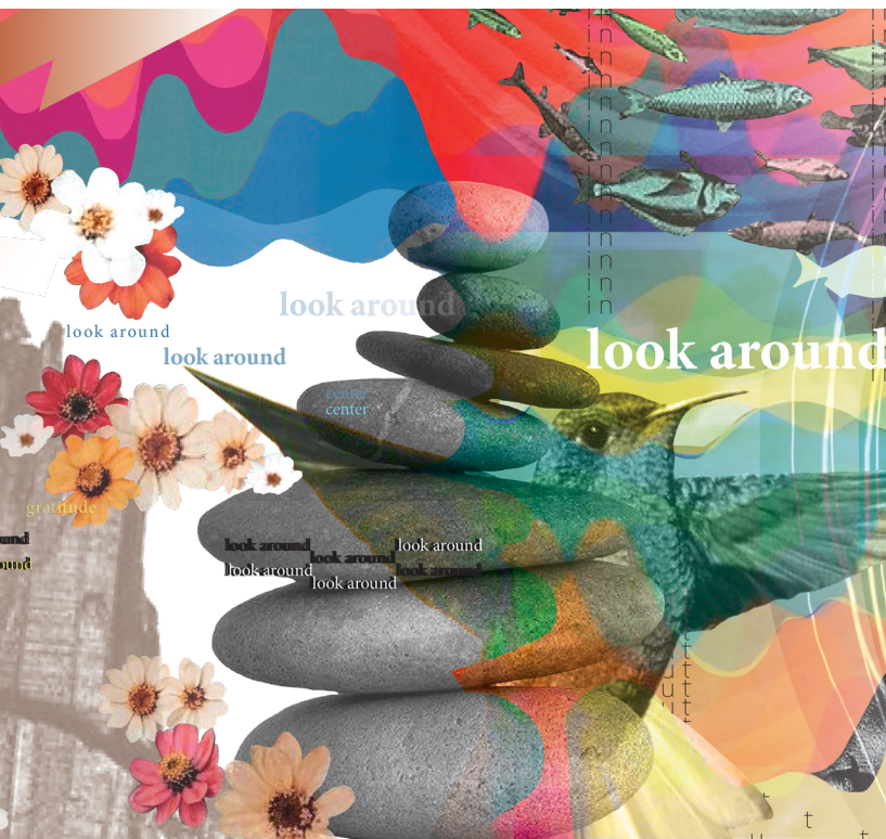
design page 2