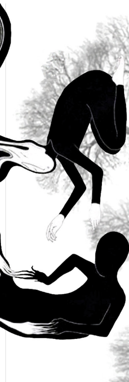
design page 7