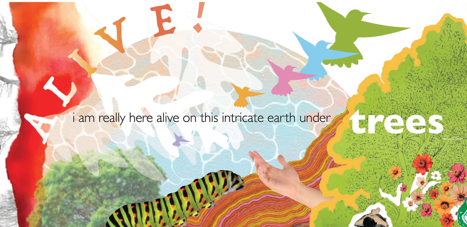
design page 8