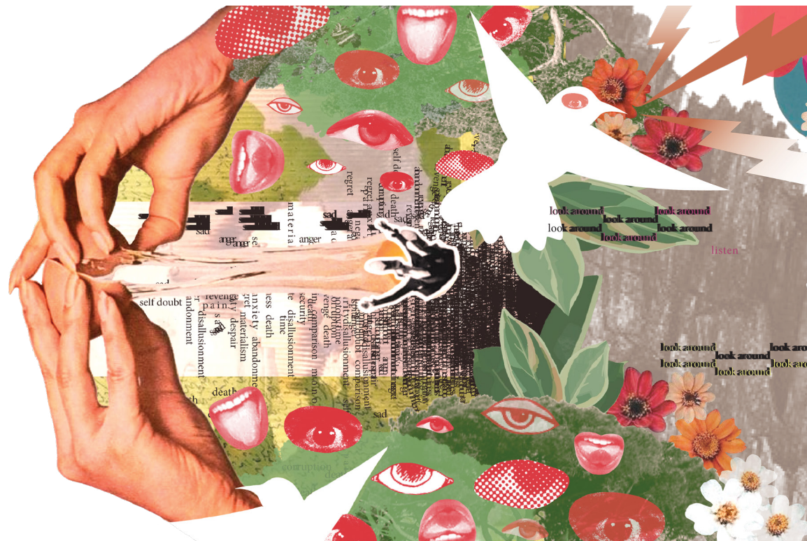
design page 1