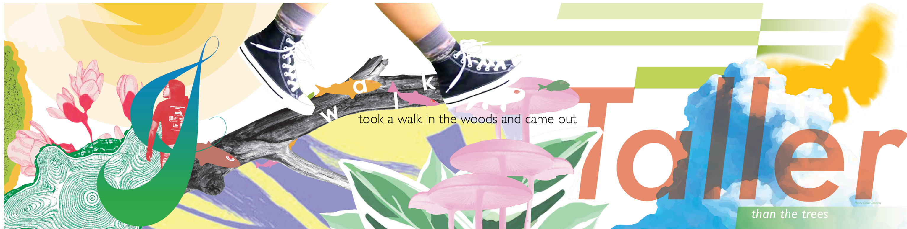
design page 9