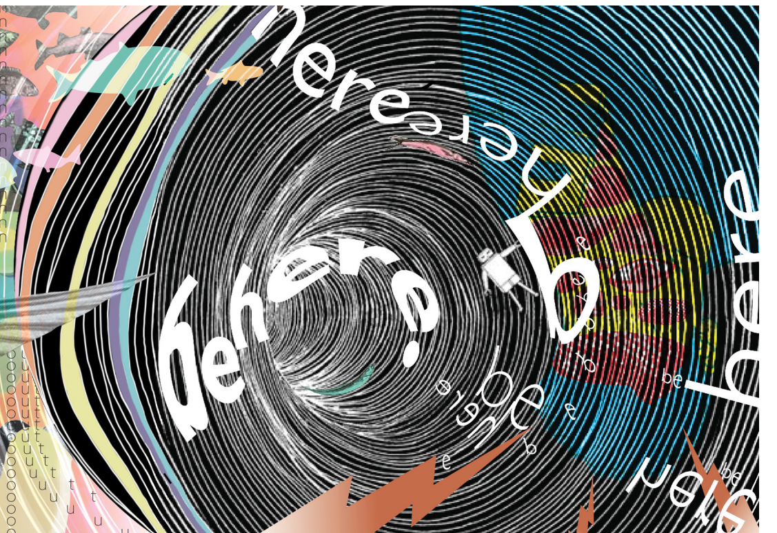
design page 3